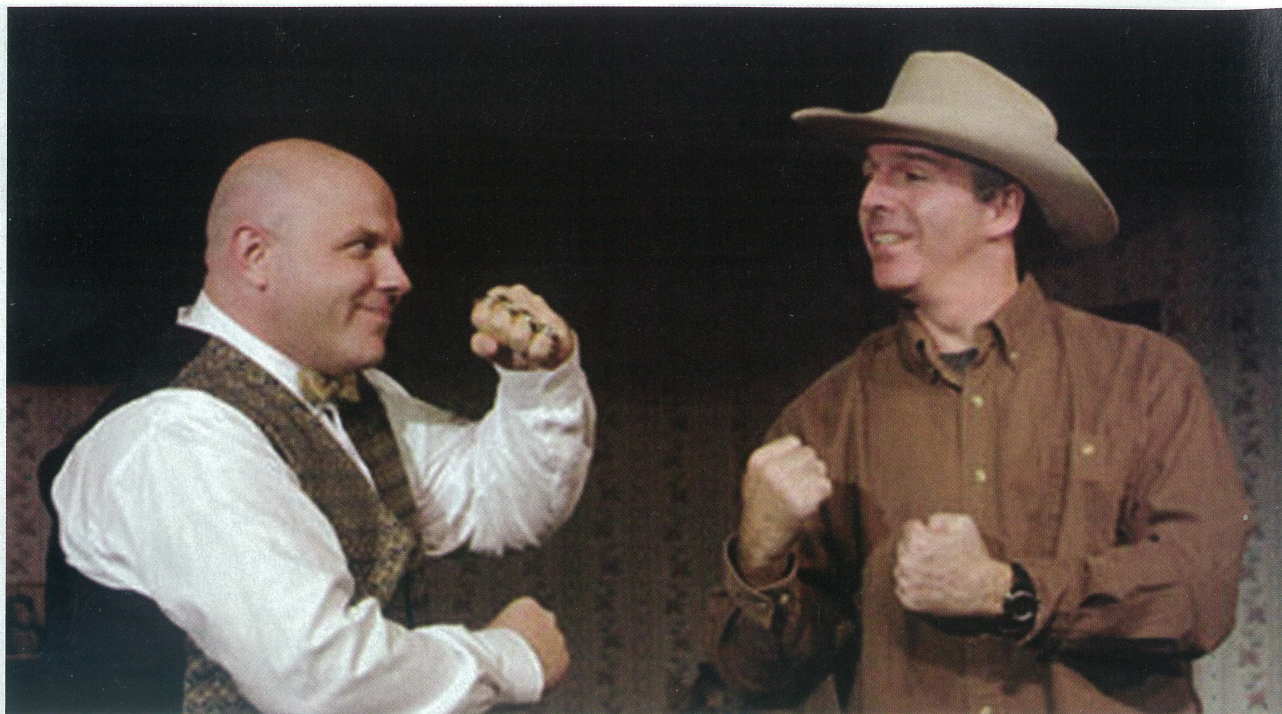
High Button Shoes, a recent Barnstable Comedy Club production.